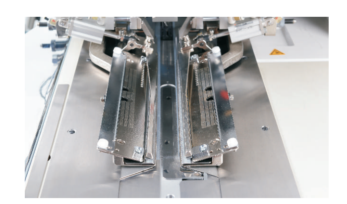
3 Big Presser Foot Adjustment, Wider Application

Large size smart touchable panel makes operation more intuitive and smoothly USB port for pattern storage and program updates. Internal SD card supports video playing.