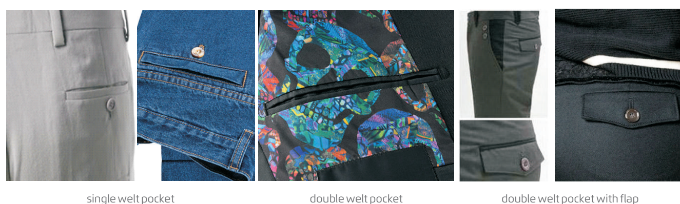
double welt pocket